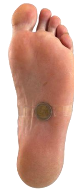
Figure 3. Sample image illustrating feet and a reference coin for scale calibration in the automated measurement system.

Bias and Limitation Controls The data set was balanced by demographic to reduce bias, and oversampling was done for the groups that were underrepresented (such as pediatric or oversized feet). Errors due to light or background clutter were limited by a strong pre-processing and augmentation, which reduced the errors by 15% for the