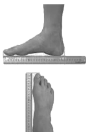
Figure 1. Manual footwear measurement using a scale compared to the automated system.

The purpose of this research is to develop an automatic foot width measurement system with the object detection model YOLOv8 [2]. This model is more rapid and precise in measuring feet. The system is based on a reference coin for the scaling. It is also employing the advanced image processing techniques such as adaptive thresholding and edge detection [4] to obtain accurate measurements. The system takes pictures, recognizes feet and coins, and calculates real-world sizes using a ratio algorithm. Then, it makes detailed PDF reports with marked dimensions (as shown in Figure 1) [5]. In a number of applications, this automation can help minimize errors and boost efficiency.