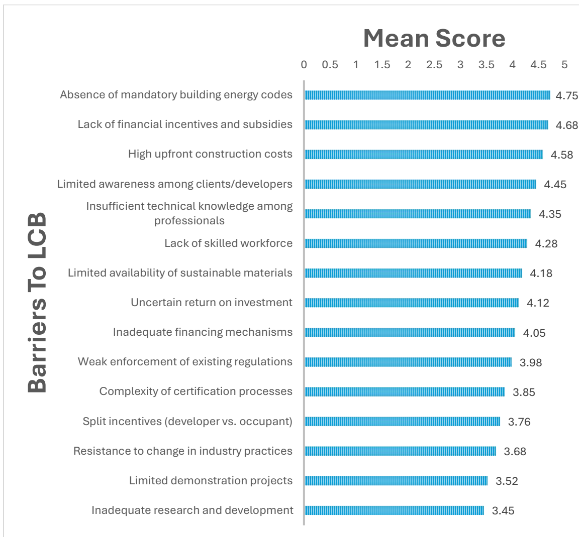
Figure. 1. Barriers to Low-Carbon Building Adoption in Pakistan